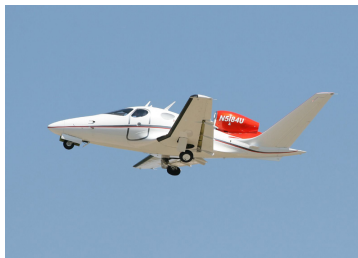
Figure 1.3.1: The motion of this Eclipse Concept jet can be described in terms of the distance it has traveled (a scalar quantity) or its displacement in a specific direction (a vector quantity). In order to specify the direction of motion, its displacement must be described based on a coordinate system. In this case, it may be convenient to choose motion toward the left as positive motion (it is the forward direction for the plane), although in many cases, the x -coordinate runs from left to right, with motion to the right as positive and motion to the left as negative.

What is the difference between distance and displacement? Whereas displacement is defined by both direction and magnitude, distance is defined only by magnitude. Displacement is an example of a vector quantity. Distance is an example of a scalar quantity. A vector is any quantity with both magnitude and direction . Other examples of vectors include a velocity of 90 km/h east and a force of 500 newtons straight down.