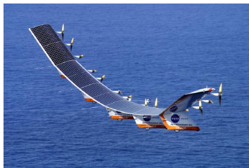
Figure 3.5.2: Solar energy is converted into electrical energy by solar cells, which is used to run a motor in this solar-power aircraft.

Another example of energy conversion occurs in a solar cell. Sunlight impinging on a solar cell (see Figure 3.5.2 ) produces electricity, which in turn can be used to run an electric motor. Energy is converted from the primary source of solar energy into electrical energy and then into mechanical energy.