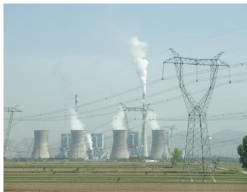
Figure 3.7.3: Tremendous amounts of electric power are generated by coal-fired power plants such as this one in China, but an even larger amount of power goes into heat transfer to the surroundings. The large cooling towers here are needed to transfer heat as rapidly as it is produced. The transfer of heat is not unique to coal plants but is an unavoidable consequence of generating electric power from any fuel—nuclear, coal, oil, natural gas, or the like.