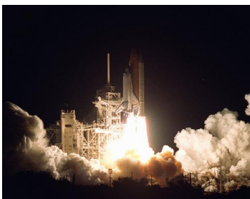
Figure 3.7.1: This powerful rocket on the Space Shuttle Endeavor did work and consumed energy at a very high rate.

Power —the word conjures up many images: a professional football player muscling aside his opponent, a dragster roaring away from the starting line, a volcano blowing its lava into the atmosphere, or a rocket blasting off, as in Figure 3.7.1 .